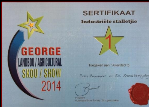
Above: First prize certificate

The SCFPA, in conjunction with Eden fire services, set up a stall at the George Agricultural Show that took place from the 21 st until the 23 rd August 2014. To promote awareness, firefighting equipment and clothing was displayed, as well as many awareness materials. Together with Eden DM, we won first prize for the best stall at the show. On the second day, a very entertaining presentation was given by Eden fire department and the SCFPA Working on Fire teams, where they performed a drill and extinguished a fire with a water drop from the Working on Fire Huey helicopter.