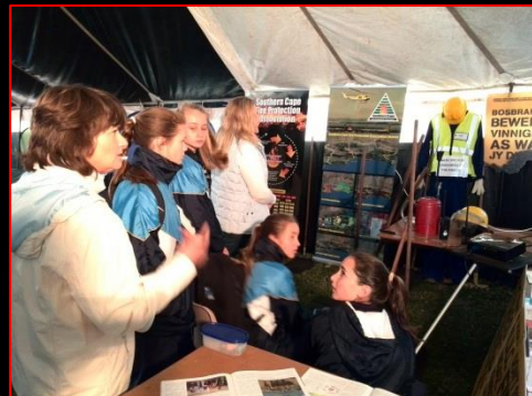
Above: School visit to stall