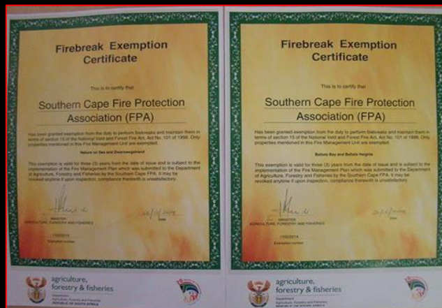
Above: Firebreak exemption certificates

Two firebreak exemptions have been approved in the Victoria Bay and Glentana areas and are the first in the Southern Cape Fire Protection Association region. These exemptions are between two FPA members, which share a common boundary and are valid for 3 years. We would like to thank the deputy director