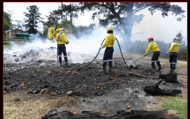
Above: Karatini stack burn - 23/10/2014

These burns and firebreaks give us as the SCFPA and fire brigades another tool to work with, as we know these areas are relatively safe. We would like to advise other SCFPA members to make an effort to increase the fire management of their property where possible.