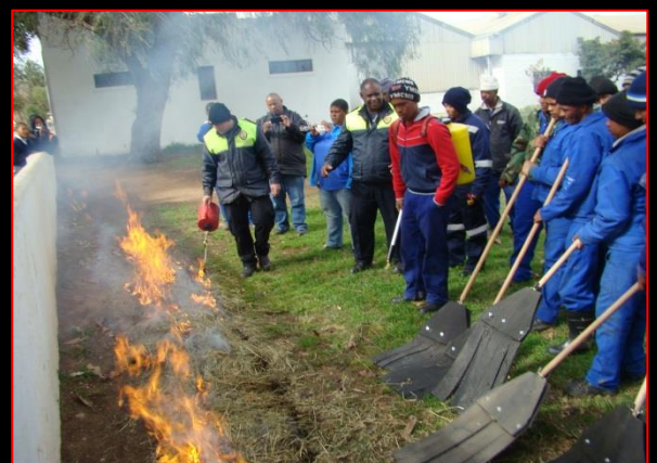
Above: Zoar 1 Day Basic Wildfire Suppression Course

A training day in the George area is also scheduled to take place before the end of the year.