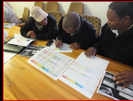
Above: FDI systems course presented at DAFF office in Knysna