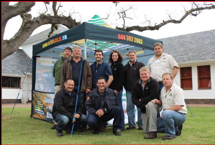
Above: SCFPA & Eden Fire and Rescue personnel at 10th Fire Symposium