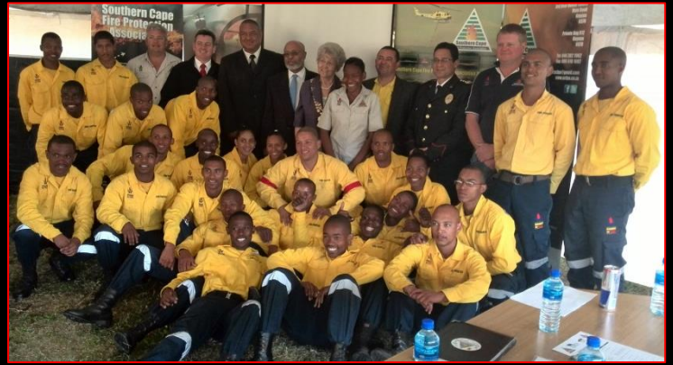
Above: Mossel Bay WoF base opening

Currently, the SCFPA manage eight WoF teams, which if fully capacitated, makes up 200 firefighters. The teams focus mainly on prevention work, such as creating firebreaks, assistance with controlled burns, etc. but they can also be called out to help fight wildfires when needed.