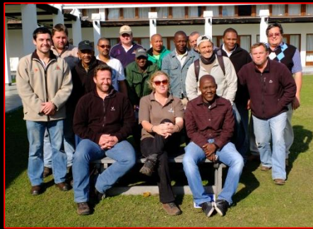
Above: Integrated Fire Management Course presented at NMMU Saasveld campus

Fourteen accredited short learning courses have been sponsored by the GEF FynbosFire project for FPAs and the organisations affiliated with them. In the Southern Cape region to date, 112 individuals, including SCFPA personnel, have received training in 9 different courses namely veldfire behaviour principles, integrated fire management principles, risk analyses, fire danger index systems, community risk reduction, fire ecology and conservation, prescribed burning, basic incident command system and urban interface management. These training courses will lead to better, increased knowledge in the area of veldfires and help improve managing the high risk in this region.