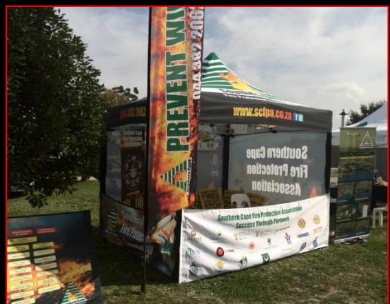
Above: Stall at Fynbos Forum

A stall was also set up by the SCFPA to create awareness relating to veldfires and the Southern Cape Fire Protection Association's responsibility.